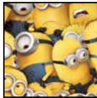
23989 S (Backing)